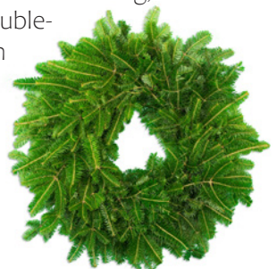
Back of a Plain Wreath

This means that wreaths are covered with greens on both the front and the back of the metal ring, unlike a single-faced wreath. Hang a double-faced wreath in a window or on a front door without worrying about a metal frame banging or scratching the surface. Our quality is hard to beat and your customers will easily notice the superior standard of a Three Rivers wreath!