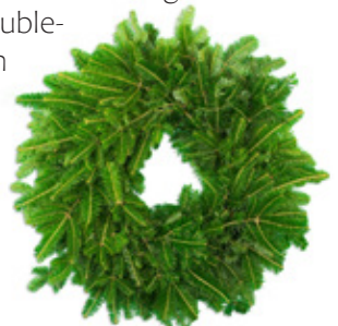
Back of a Plain Wreath

This means that wreaths are covered with greens on both the front and the back of the metal ring, unlike a single-faced wreath. Hang a double-faced wreath in a window or on a front door without worrying about a metal frame banging or scratching the surface. Our quality is hard to beat and your customers will easily notice the superior standard of a Three Rivers wreath!