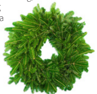
Back of a Plain Wreath

Three Rivers wreaths are always double-faced. This means that wreaths are covered with greens on both the front and the back of the metal ring, unlike our single-faced competitors. Hang our wreaths in a window or on a front door without worrying about a metal frame banging or scratching the surface. Our quality is hard to beat and your customers will easily notice the superior standard of a Three Rivers wreath!